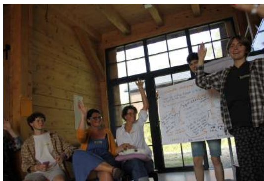
Photo-documentary exhibition "Fleeing the Holocaust: Jewish refugees in the Caucasus and Asia"

The Social Entrepreneurs HUB team has created a 3 live ZOOM course dedicated to Ukrainians to help them understand the business culture in Moldova, some legislative issues and other important moments. The recordings in Russian are available to watch on our YouTube channel. Click to access the playlist .